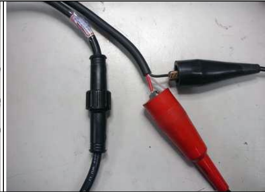
7. Dielectric Withstanding Voltage Test