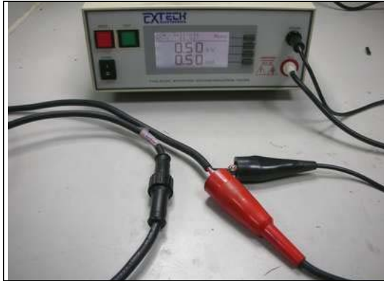
6. Dielectric Withstanding Voltage Test